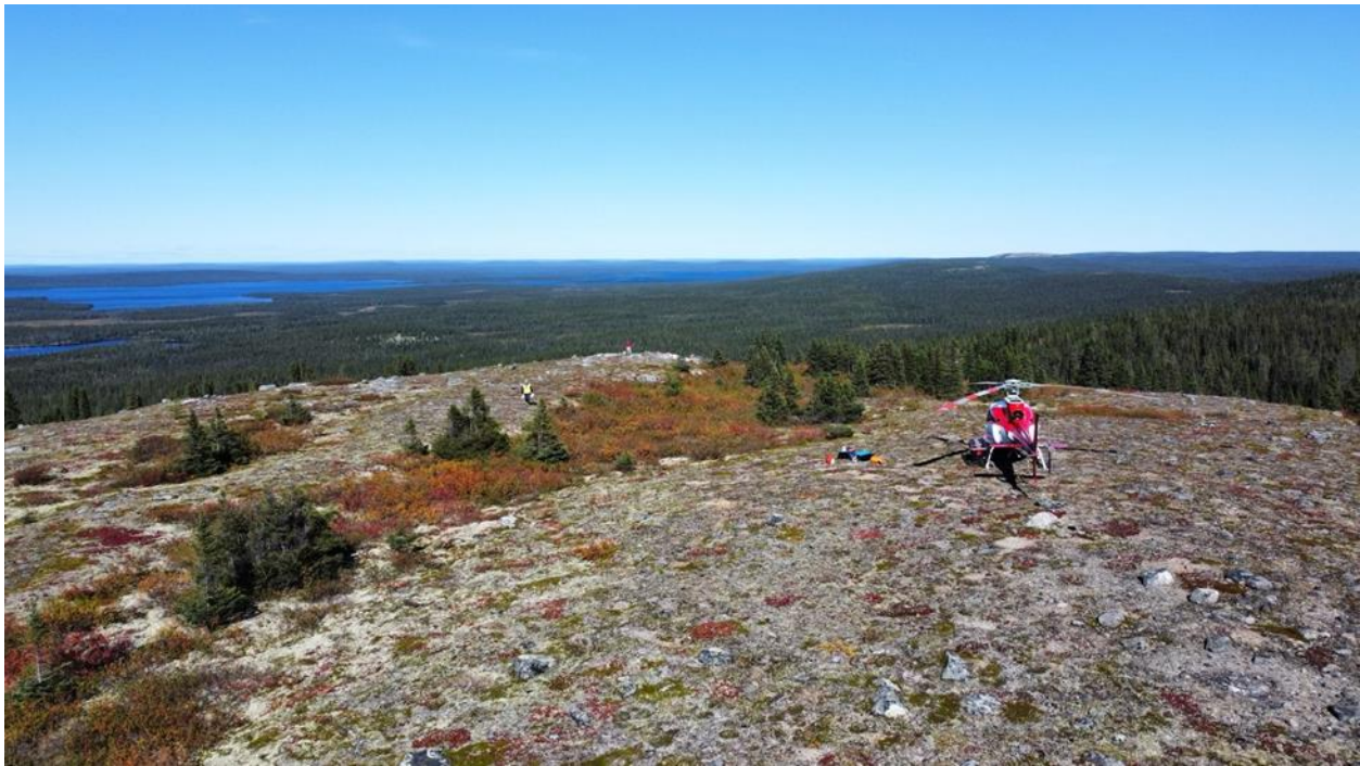
Spodumene Mountain – outcrop measures 600 x 200 metres and has relief of 50 metres. The outcrop is open in all directions. Channel sampling took place less than 100 metres to the south (bottom of photo).