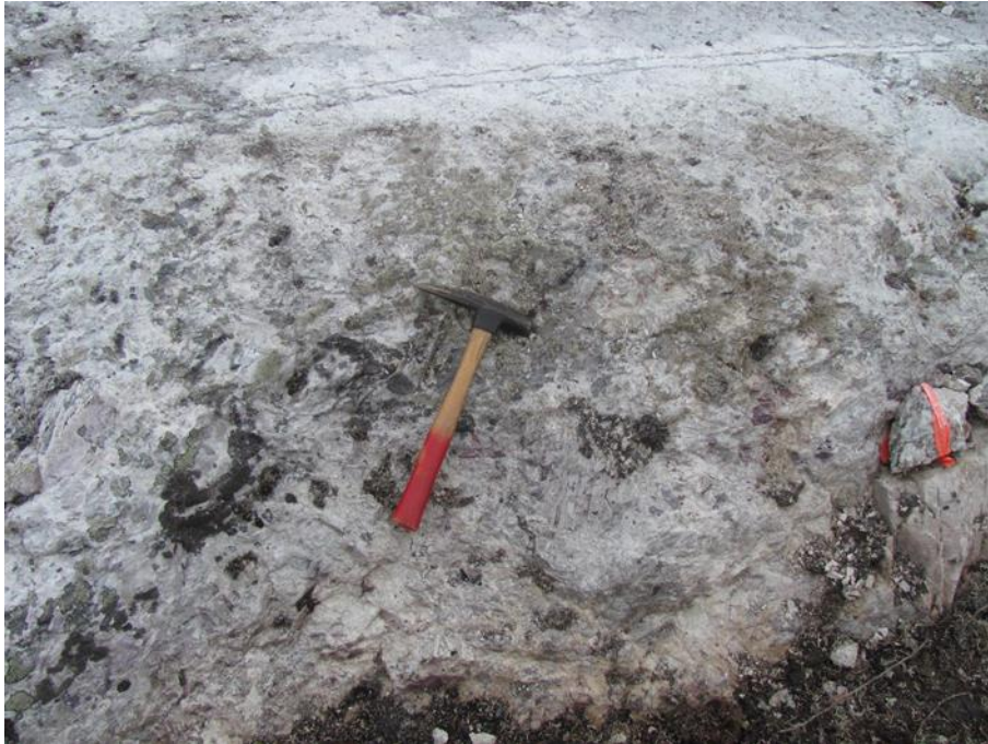
Photo #3 – Megacrystic spodumene-rich pegmatite adjacent to Channel #1, Spodumene Mountain